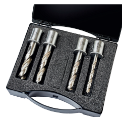
JEITD-SET Handy 4 pc kit in plastic case