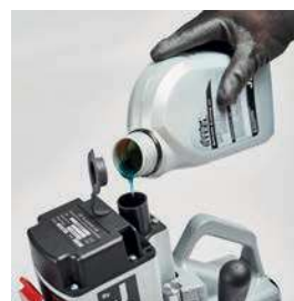
Soluble cutting oil with MiniBeast