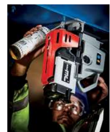
Endurance+ spray drilling upside down