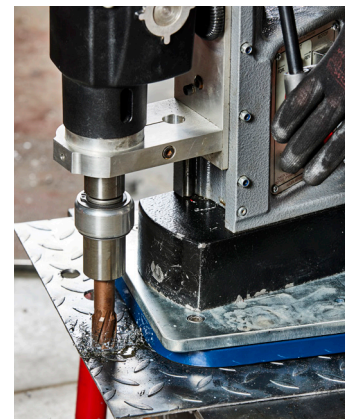
Ideal for checker plate flooring