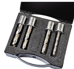
JEITD-SET Handy 4 pc kit in plastic case