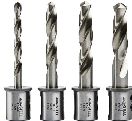
Supplied with 19 mm shank, flute length = 65 mm