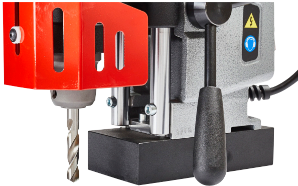
Perfect for use in JEI's MiniBeast

Provides the ability to convert a magnetic drilling machine to a small drill press without the need of a chuck.