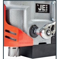
Accepts 35 mm D.O.C Turbo Tough TCT cutters