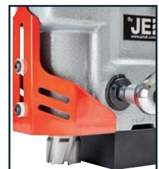
35 mm TCT cutter capacity