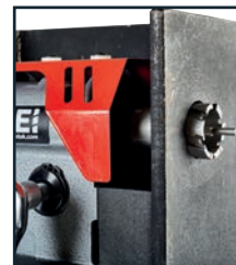
Compact design makes suitable for onsite & bridge work drilling applications.