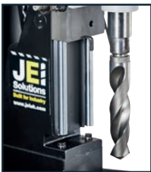
Solid drills up to 52 mm 5MT