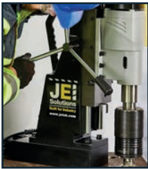
Creates a threaded hole up to M52.