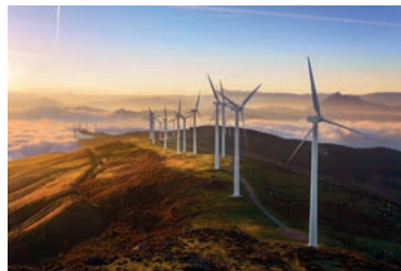
Wind turbine industry