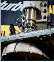
Incredible 200 mm Ø cutting capacity.

The world's largest capacity portable magnetic drill, designed to solve the most challenging of applications.