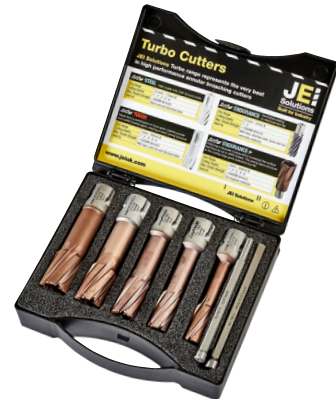
Long series Kit (55 mm depth of cut)