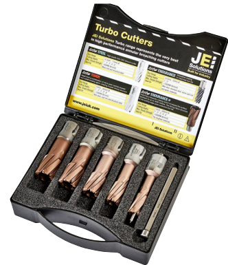
Short series Kit (35 mm depth of cut)