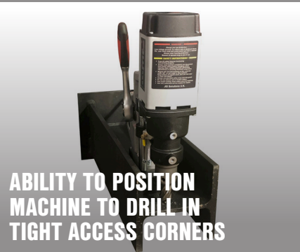
ABILITY TO POSITION MACHINE TO DRILL IN TIGHT ACCESS CORNERS