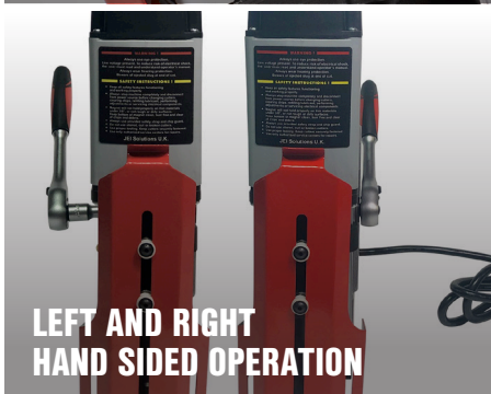
LEFT AND RIGHT HAND SIDED OPERATION