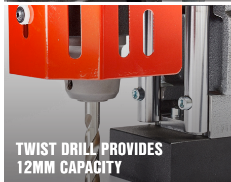
TWIST DRILL PROVIDES 12MM CAPACITY