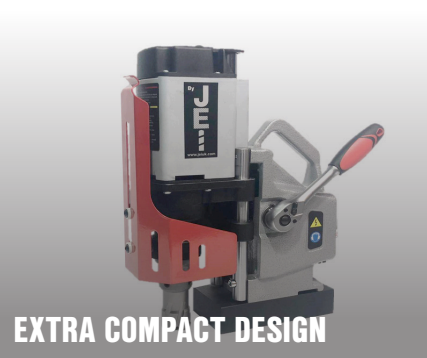
EXTRA COMPACT DESIGN