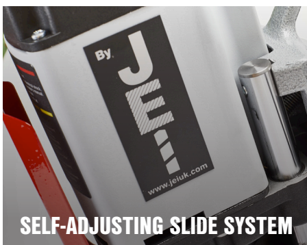
SELF-ADJUSTING SLIDE SYSTEM