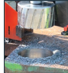
200 mm Ø cutter capacity