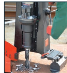
45 mm Ø solid drill capacity