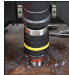
M48 tapping capacity